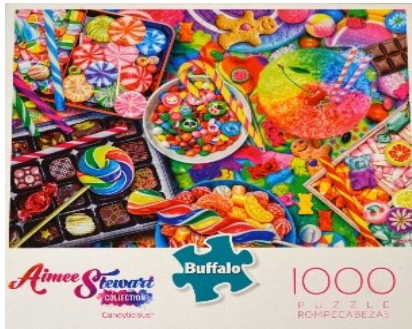
What it will look like when completed